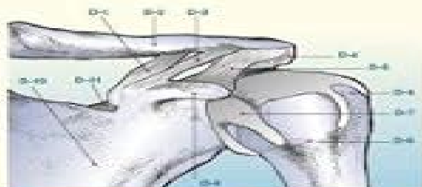
SHOULDER – ANTERIOR CLOSE-UP