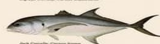
Jack Crevalle ( Caranx hippos )