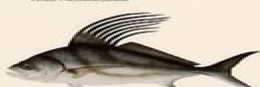
Bonefish ( Albula vulpes )