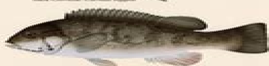
Tring ( Tringus )