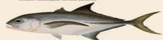
Horse Eye Jack ( Centropomus labrus )