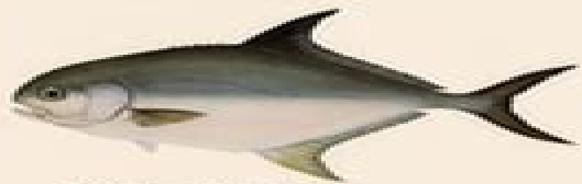
Florida Pompano ( Pomatomus saltatrix )