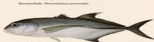
Big Eye ( Centropristis striata )