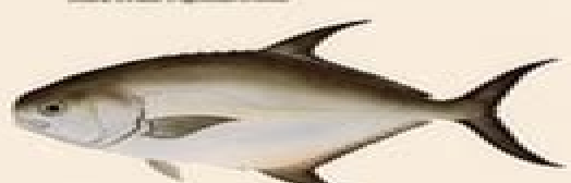
Pompano ( Pomatomus saltatrix )