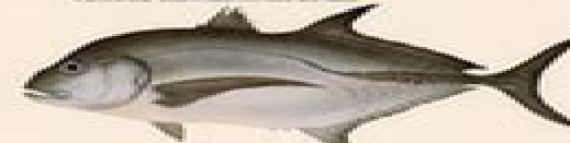
Horse Eye Jack ( Centropomus labrus )