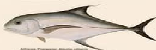
Florida Pompano ( Pomatomus saltatrix )