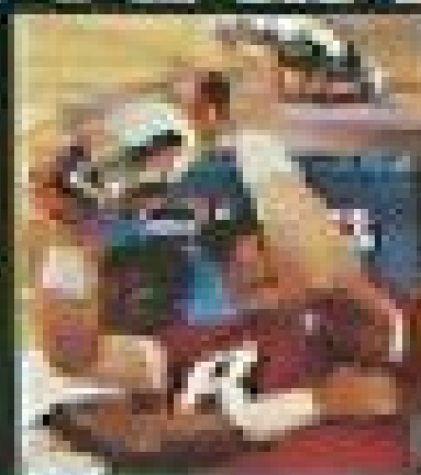
PLAYBOOK BOOK BY DAN FELTS