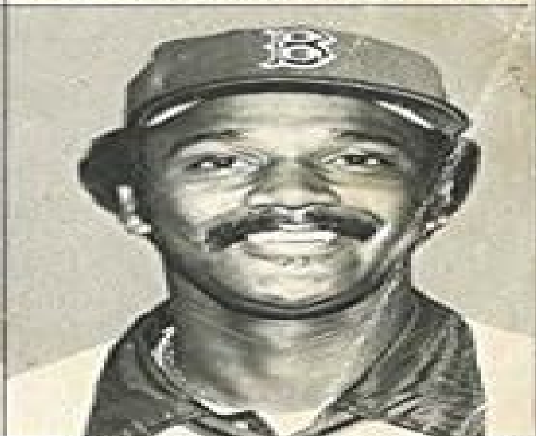
JIM RICE, Boston Red Sox

PUBLISHED BY The Sporting News P79 $5.00