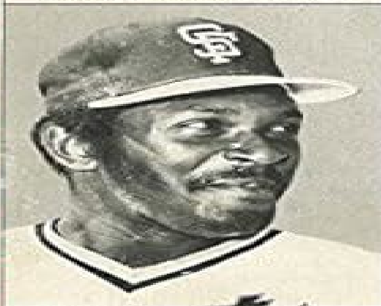
VIDA BLUE, San Francisco Giants