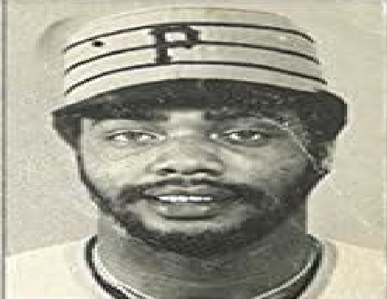
DAVE PARKER, Pittsburgh Pirates