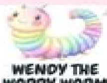
WENDY THE WORRY WORM