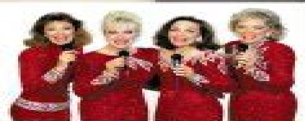
The Lennon Sisters