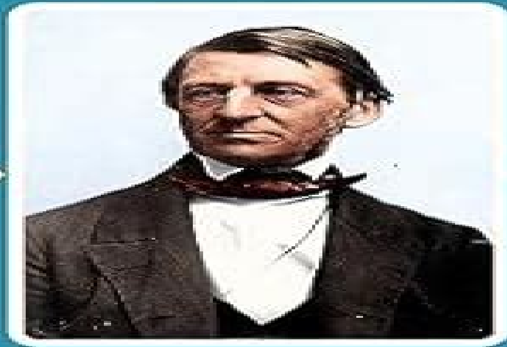
RALPH WALDO EMERSON