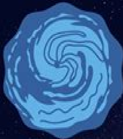
Strong Hurricane 90 kPa

A perfect vacuum contains no particles at all. It has a pressure of 0.