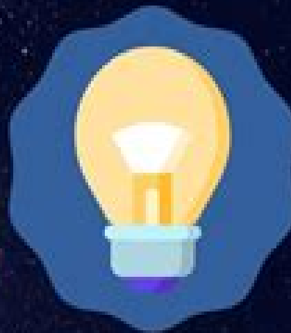
Incandescent Lightbulb < 10 Pa