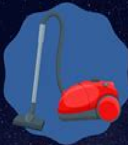
Vacuum Cleaner 80 kPa