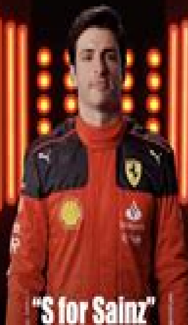
"S for Sainz"