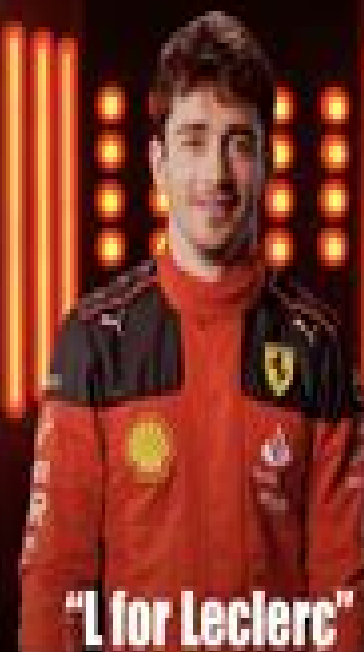
"L for Leclerc"