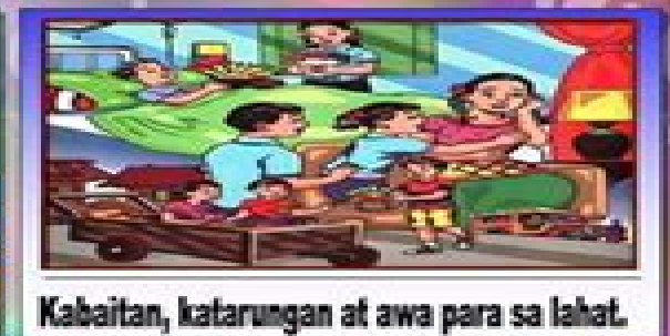
Kabaitan, katarungan at awa para sa lahat.