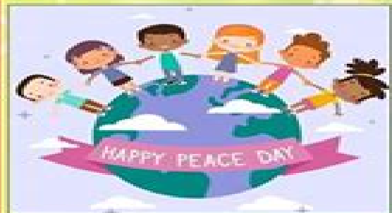
GLOBAL PEACE MONTH