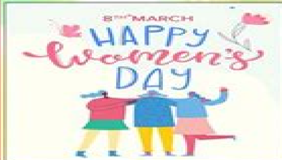
NATIONAL WOMAN'S DAY