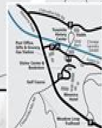
Wawona See the Yosemite Guide for information about trail conditions.