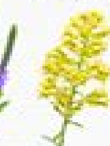
Showy Goldenrod Solidago speciosa Blooms: July - October