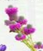
Purple Prairie Clover Dalea purpurea Blooms: June - August