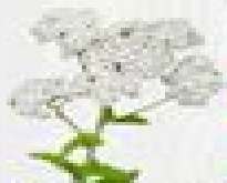
Common Yarrow Achillea millefolium Blooms: June - September