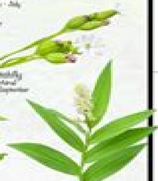
Starry False Solomon's Seal Maianthemum stellatum Blooms: May - June