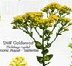
Stiff Goldenrod Solidago rigida Blooms: August - September