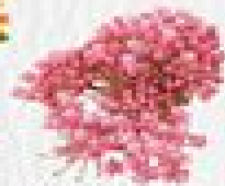
Swamp Milkweed Asclepias incarnata Blooms: June - September