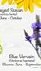
Blue Vervain Verbena hastata Blooms: June - September