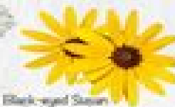
Black-eyed Susan Rudbeckia hirta Blooms: June - October