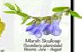
Marsh Skullcap Scutellaria glaucochloa Blooms: June - August