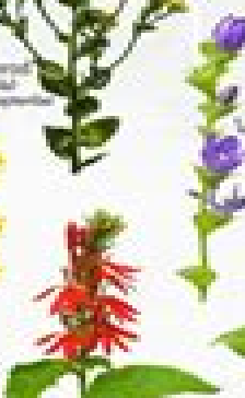
Cardinal Flower Lobelia cardinalis Blooms: July - September