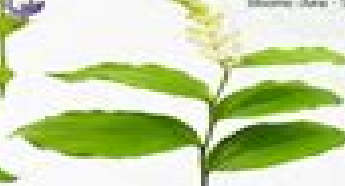
False Solomon's Seal Maianthemum racemosum Blooms: May - June