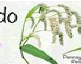
Nodding Smartweed Persicaria hypoleuca Blooms: July - September