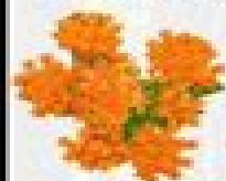
Butterfly Milkweed Asclepias tuberosa Blooms: June - September