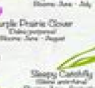
Sleepy Catchfly Silene acaulis Blooms: June - September