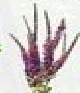
Lead Plant Amorpha canescens Blooms: June - August