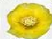
Prickly Pear Cactus Cholla Blooms: June - July