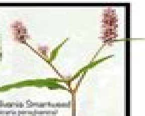
Pennsylvania Smartweed Persicaria pennsylvanica Blooms: June - September