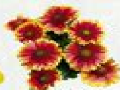
Blanketflower Gaillardia arvensis Blooms: May - September