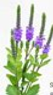
Hoary Vervain Verbena stricta Blooms: June - September