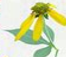
Cut-leaf Coneflower Rudbeckia laciniata Blooms: July - September