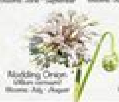
Nodding Onion Allium cernuum Blooms: July - August