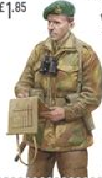
Officer, 40th Royal Marine Commando, 2014