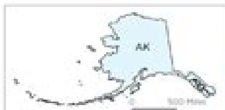
Figure 2. Percentage of State Population Living in Persistent Poverty Counties: 1989 to 2015–2019