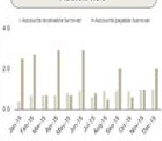
Add text here