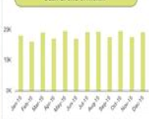
Cash at end of month