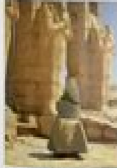
The temple is the largest of the four, but the most damaged, for the reason an unexpected earthquake. It is the largest of the four, but the most damaged, for the reason an unexpected earthquake.