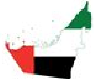
United Arab Emirates