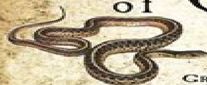
COMMON GARTER SNAKE Thamnophis sirtalis