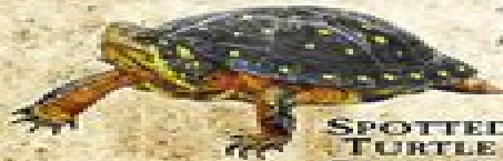
SPOTTED TURTLE Emydoidea maculata