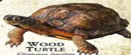
WOOD TURTLE Glyptemys insculpta