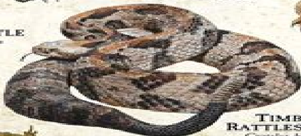
TIMBER RATTLESNAKE Crotalus horridus