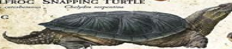
COMMON SNAPPING TURTLE Chelydra serpentina