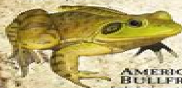
AMERICAN BULLFROG Lithobates catesbeianus