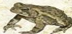
FOWLER'S TOAD Anaxyrus fowleri