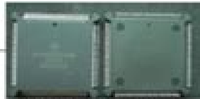
Embedded DSP processor (DSP)