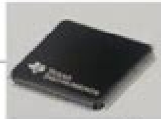
Embedded microprocessor (MPU)