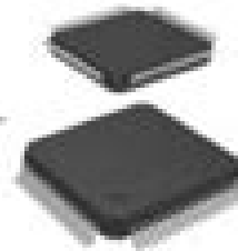
Embedded microcontroller (MCU)