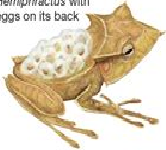
Hemiphractus with eggs on its back