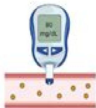
Type 2 Diabetes Mellitus