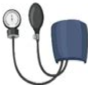
Elevated Blood Pressure