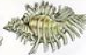
Lace Murex (CB)

Cerithium foliatum To 1.5 in. (3.8 cm) high Shell has three large, leaf-like flanges. Color varies from white to dark brown depending on location.