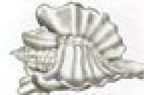
Foliate Thornmouth (W)

Cerithium foliatum To 1.5 in. (3.8 cm) high Shell has three large, leaf-like flanges. Color varies from white to dark brown depending on location.