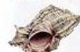
Apple Murex (CB)

Murex filiculus To 1 in. (2.5 cm) Elaborate pinkish-white to brownish shell with long flaps.