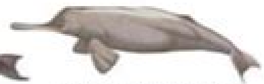
Ganges River Dolphin