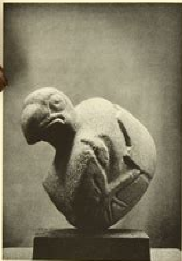
Example of the Egg & Spoon, 1937, The Museum of Modern Art.