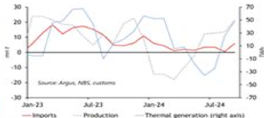
YoY change in China coal fundamentals

Global thermal coal markets had arguably their first normal, post-COVID, post energy crisis year in 2024, making the year an important yardstick by which to measure the coming years. This paper will cover key market developments in 2024 and highlight how these factors will be influential to coal trade flows and pricing for the year to come.