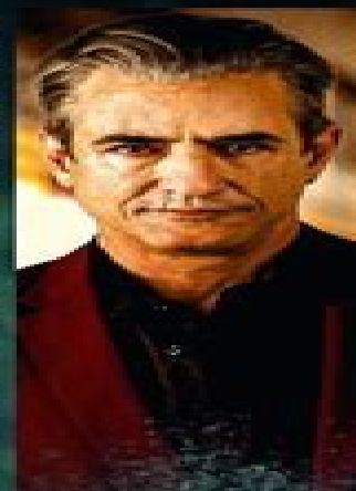
WITH DERMOT MULRONEY