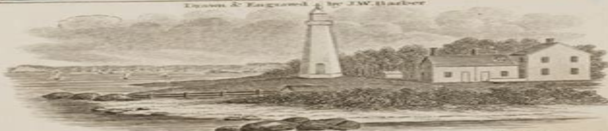
View of the Light House S. of New Haven Conn.