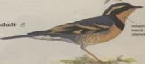
relatively long neck and slender head

Voice: Song a single, long whistle on one pitch one and a half seconds long and repeated about every ten seconds; each whistle on a different pitch; some notes trilled or buzzy. Call a short, low, dry chirp very similar to Hermit Thrush but harder; also a hard, high chirp and a soft, short flap. Flight call a short, humming whistle.