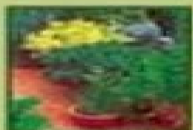
SEASONAL PLANT LISTS

A practical guide to gardening throughout the year