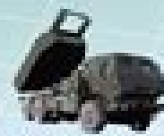
High Mobility Artillery Rocket System