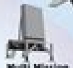
Multi Mission Radar