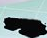
Next-Gen Armoured Tracked Carrier