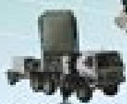
TPQ-53 Weapon Locating Radar