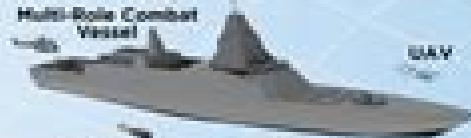
Multi-Role Combat Vessel