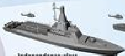
Independence-class Littoral Mission Vessel