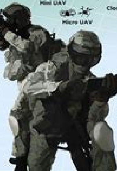
Next-Gen Infantry Battalion