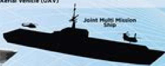
Joint Multi Mission Ship