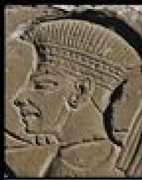
Philistine with "feathered helmet" on relief from Medinet Habu, Thebes by Ramses III

"No land could stand before their arms: from Hatti, Qode, Carchemish, Arzawa, Alashiya on, being cut off at one time" (Medinet Habu, Ramses III, 1177 BC) The hero's of Homer's Iliad and the Odyssey are the bad boys of the bible (Philistines). Hadrian renamed Judea "Palastina" which literally means "Philistina"