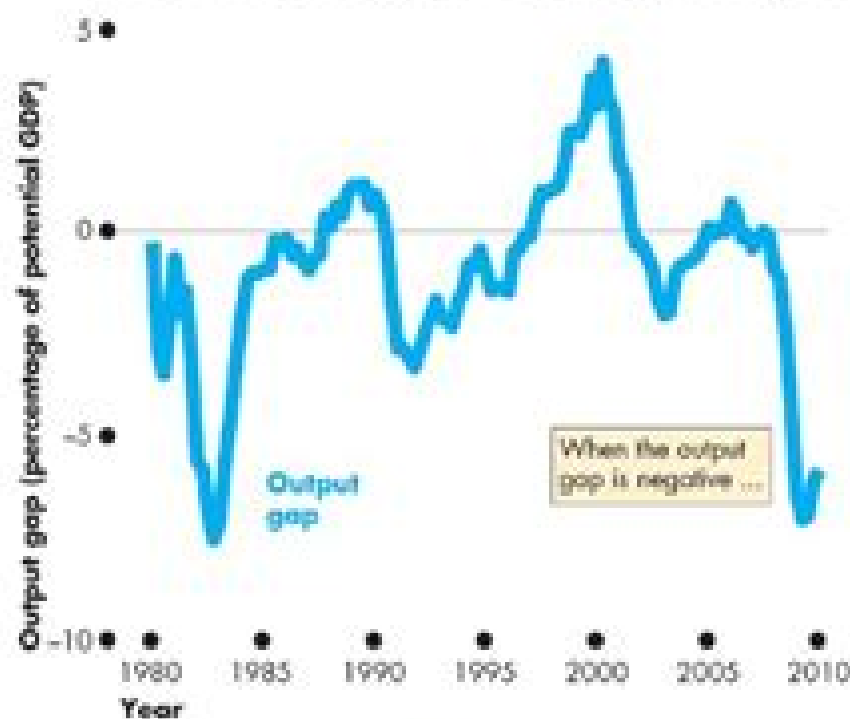
(a) Output gap

Figure 22.5 shows the output gap and ... the fluctuations of unemployment around the natural rate.