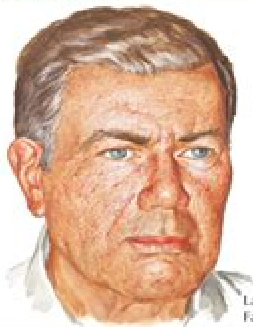
Large, strong, muscular man typical patient. Face may have peau d'orange skin, telangiectasis.