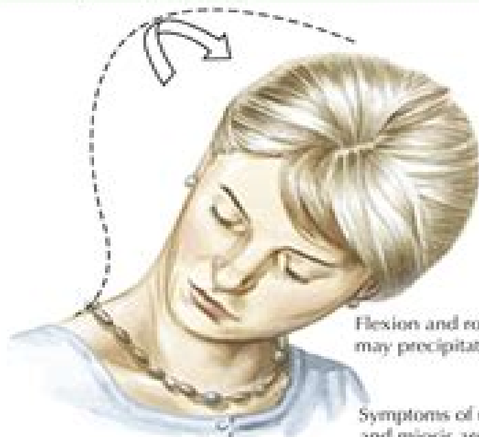
Flexion and rotation of neck may precipitate attack.

Symptoms of unilateral headache with lacrimation, rhinorrhea, and miosis are present in CHP but are of short duration.