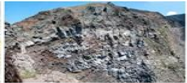
Continental volcanic rock antimony deposit