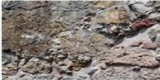
Carbonate rock antimony deposits