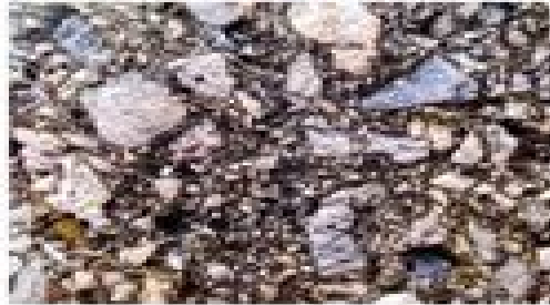
Clastic rock antimony deposits