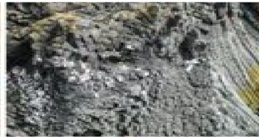
Continental volcanic rock antimony deposit