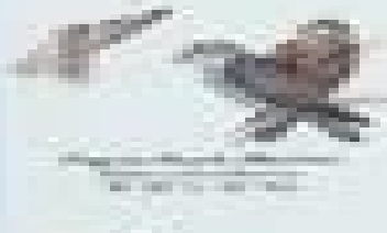
Mourning Dove Pigeon