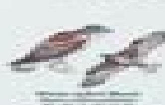
House Sparrow Starling