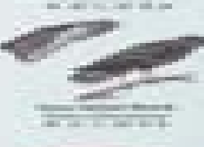
European Starling Ring-necked Pheasant