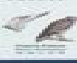
Wild Turkey Turkey Vulture