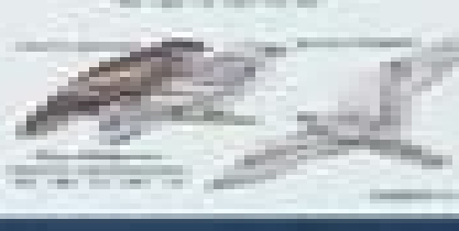
Turkey Vulture Bald Eagle