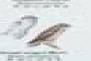
Rock Dove Rock Pigeon