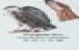
Barred Owl Screech Owl