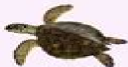
Hawksbill Sea Turtle