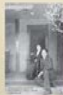
Wolfe's Thomas Wolfe was a boy from Asheville. He was a young man, he was not a young man, and he was not a young man, and he was not a young man, and he was not a young man.

who comes of age in a small, mountain town in the south during the early years of the 20th century. Wolfe modeled many of the more than 200 characters in the story on members of his own family and citizens of Asheville. In the story, he forever immortalized his hometown as "Altamont" and his mother's boardinghouse, Old Kentucky Home , as "Dixieland."