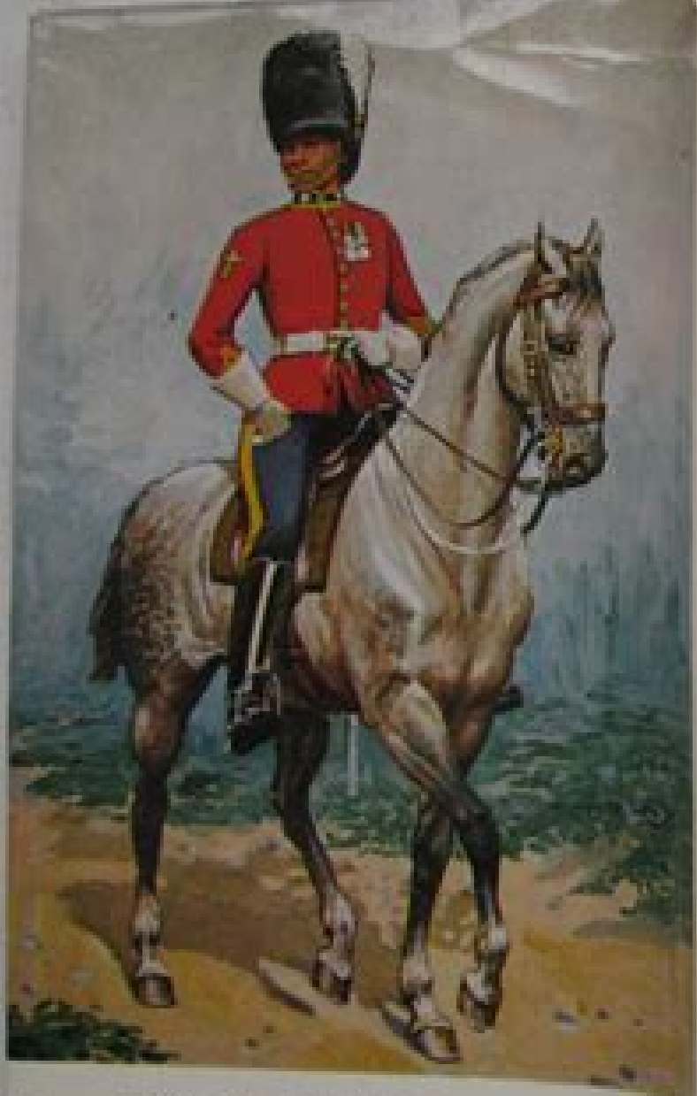
Regimental Scout, Royal Scots Greys, c.1900