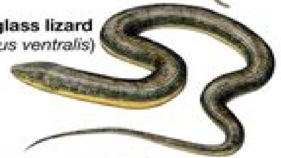
eastern glass lizard ( Ophisaurus ventralis )