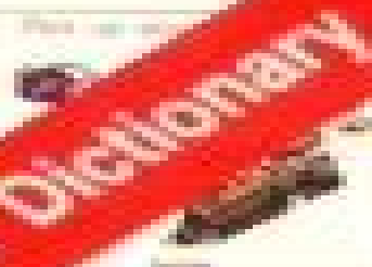
20002 Car / Autó