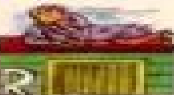
20013 Person / Ember