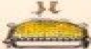
20015 Car / Autó