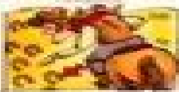
20009 Horse / Ló