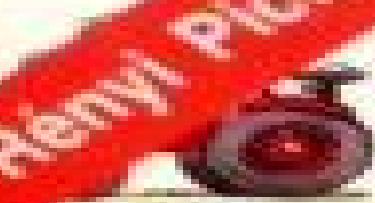
20005 Motorcycle / Motoros