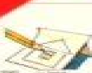
20003 Pencil / Részeg