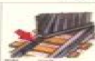
20004 Train / Vonat