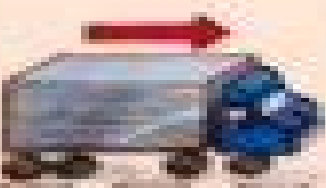
20017 Truck / Kamion