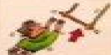
20020 Dog / Kutya