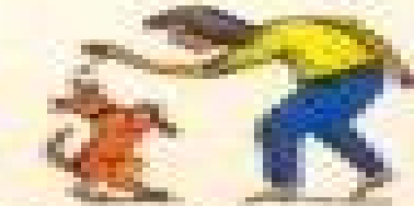
20012 Dog / Kutya