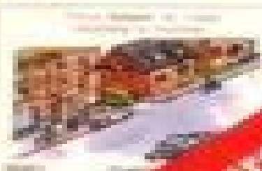
20001 City Street / Városi Utca