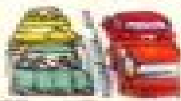
20007 Tunnel / Alagút