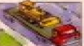
20018 Car / Autó