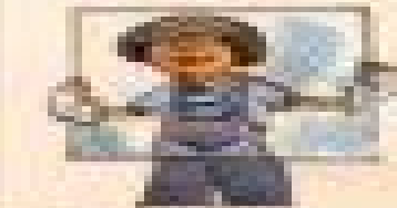
20016 Sign / Jel