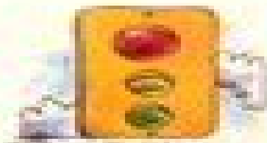
20008 Traffic Light / Forgófény