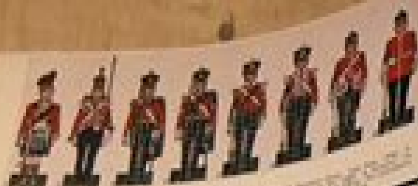
SEVEN REGIMENTS, 1660-1670. The first six are the regiments of the Earl of Argyll, the seventh is the regiment of the Earl of Mar.