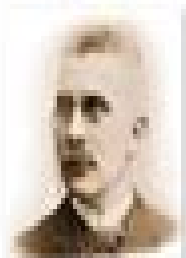
Henry Louis Le Châtelier