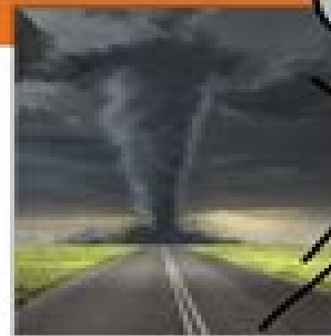
Tornadoes stretch up and carry debris up to 100 miles away.

Tornadoes can move 30-70 miles per hour and destroy everything in their path. They can drop buildings as far as 100 feet. Tornadoes can also move faster with so much force that it sticks into tree trunks. Most tornadoes only last a few minutes. But high-speed winds can break apart buildings, knock down trees, and lift cars into the air. The wind