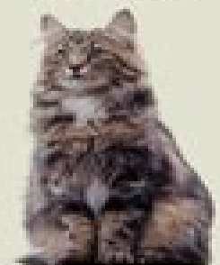
Bosque de Noruega