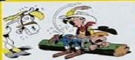
Billy the Kid