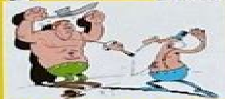
Les Collines Noires