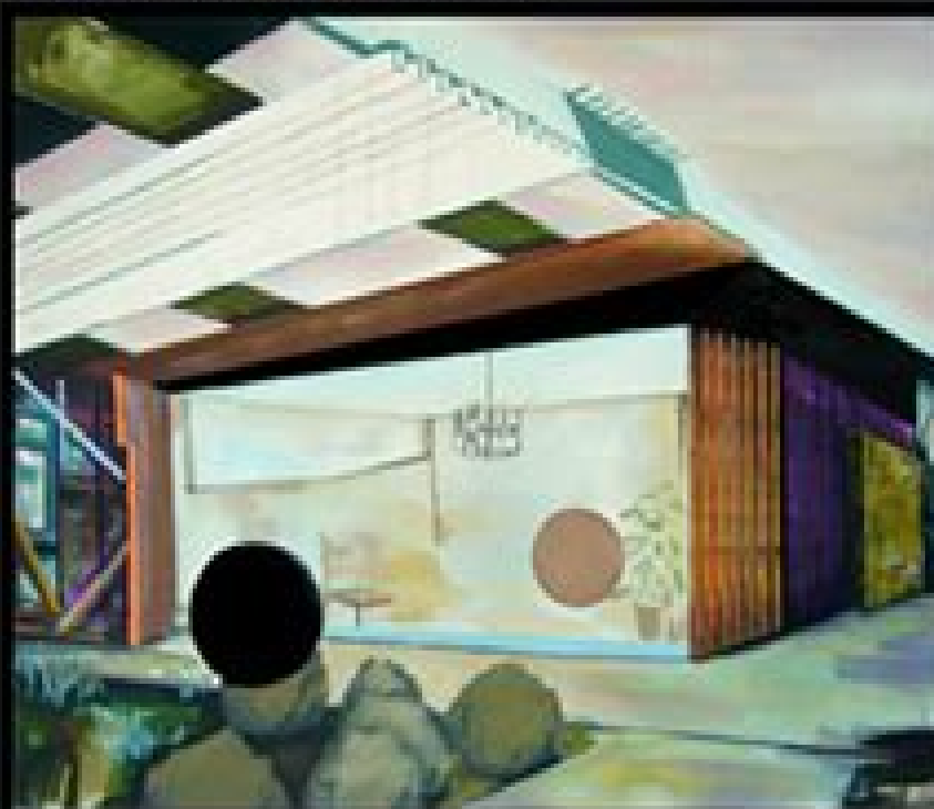
01/43 #1, 150cm x 185cm, Öl auf Leinwand, 2007