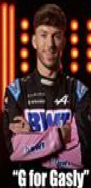
"G for Gasly"