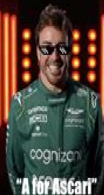
"A for Ascari"