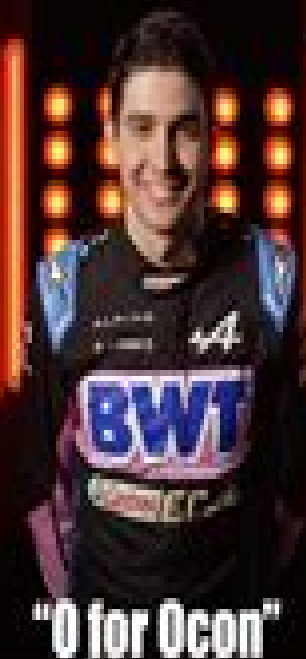
"O for Ocon"