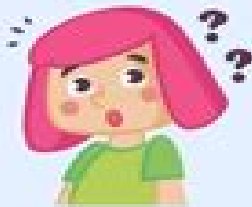
Confusion and Difficulty speaking