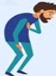
Weak or tired