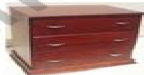
Chest of drawers