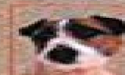
jack russell's terriers